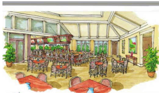
HERITAGE BAY GOLF & COUNTRY CLUB CONCEPTUAL DRAWING OF INTERIOR OF GRILLE ROOM EXPANSION