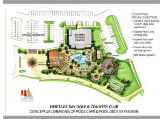
Resort Style Pool Complex