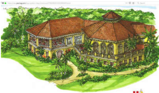
HERITAGE BAY GOLF & COUNTRY CLUB CONCEPTUAL DRAWING OF EXTERIOR OF GRILLE ROOM EXPANSION