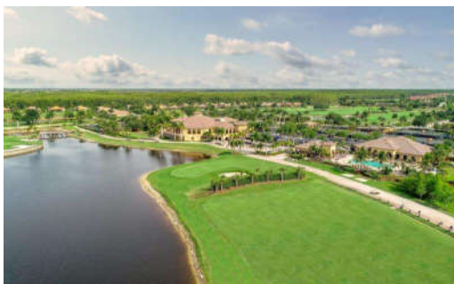
Heritage Bay Aqua Range & Practice Green