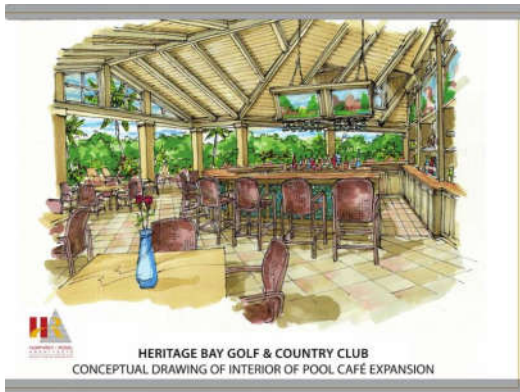
Outdoor Pool Cafe